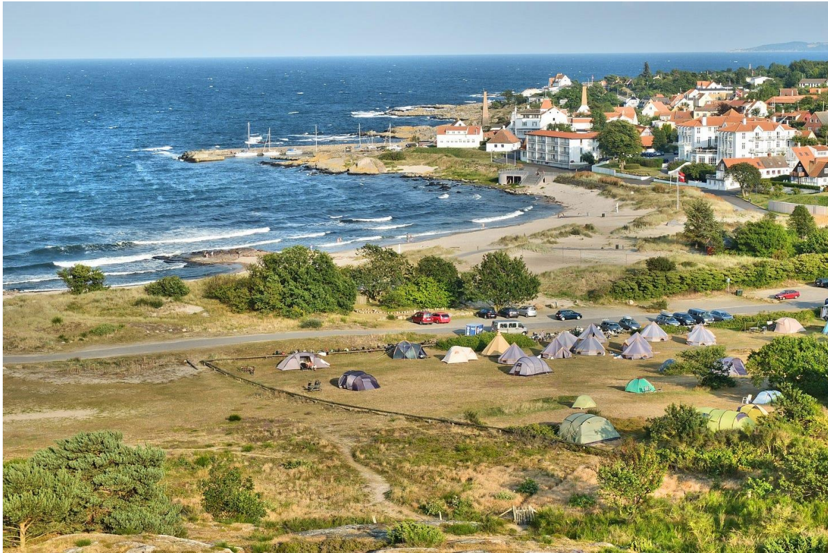
“The Norwegian navy was quick to find the right spot, in the shallow water a few miles off Denmark’s Bornholm Island . . .”