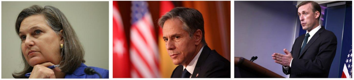
THE PLAYERS Left to right: Victoria Nuland, Anthony Blinken, and Jake Sullivan.

Over the next several meetings, the participants debated options for an attack. The Navy proposed using a newly commissioned submarine to assault the pipeline directly. The Air Force discussed dropping bombs with delayed fuses that could be set off remotely. The CIA argued that whatever was done, it would have to be covert. Everyone involved understood the stakes. “This is not kiddie stuff,” the source said. If the attack were traceable to the United States, “It’s an act of war.”