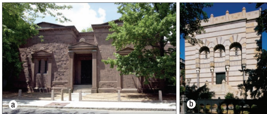
Figure 1. Buildings of the Yale secret societies. (a) Skull and Bones. (b) Scroll and Key.

Each society owns an impressive mausoleum-like “tomb” in which meetings are held each Thursday and Sunday evening (Figure 1). These are massive, very impressive structures, foreboding and bearing an unmistakable message: “Private; keep out.” Although the activities of the society are secret, their existence and membership are not. Rather than being hidden away in some dark recess of the Yale campus, Skull and Bones lies directly across High Street from Yale’s old campus, where 1400 freshmen live, next door to the art gallery on one side and to one of the residential colleges on the other. Wolfshhead is located on York Street, near two of the residential colleges, the offices of the Yale Daily News , and fraternity row. Book and Snake is located just a few yards from the freshman commons dining hall. So in the course of a day, hundreds of Yale students will pass by these tombs, all the while wondering what does go on in there.