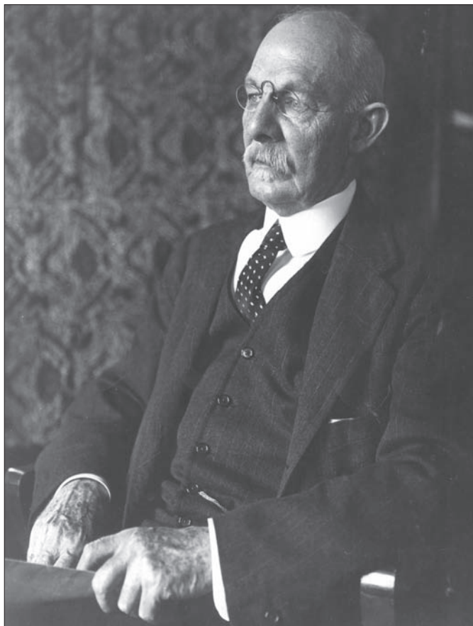
Figure 4. William Halsted, the first professor of surgery at Johns Hopkins and widely regarded as America’s foremost academic surgeon.