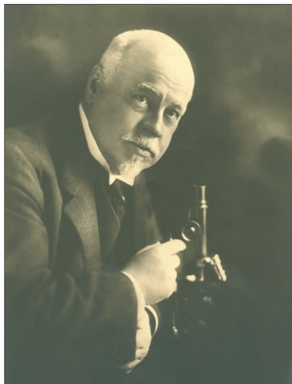
Figure 3. William Henry Welch, the founding dean of the Johns Hopkins School of Medicine.