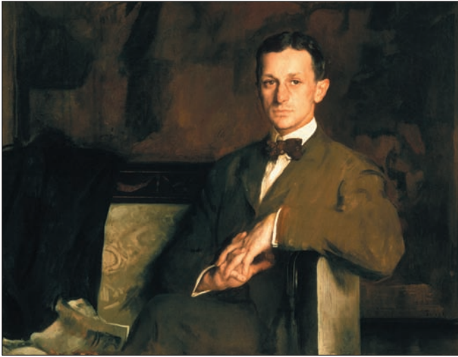
Figure 5. Harvey Williams Cushing, Halsted's first resident at Johns Hopkins and the founder of neurosurgery in America. Oil on canvas, by American artist Edmund Tarbell.

As one of the leaders of his class at Yale, Cushing knew that he stood an excellent chance of being “tapped” by one of the senior societies. In a letter to his father, he wrote: “I have about made up my mind to go with Scroll and Key if I am a good enough man to get an election, as much the better men are going that way in our class. I think that my chances of going to Bones are better, and that if I should I would perhaps meet better men when I get out of College.” His comments are certainly a backhanded compliment to Skull and Bones; it is uncertain if he turned down